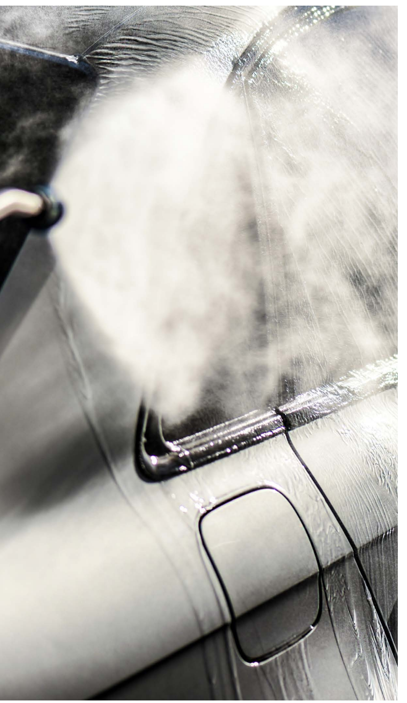
*Visit <u>ceramicpro.com/shop</u> to purchase recommended products